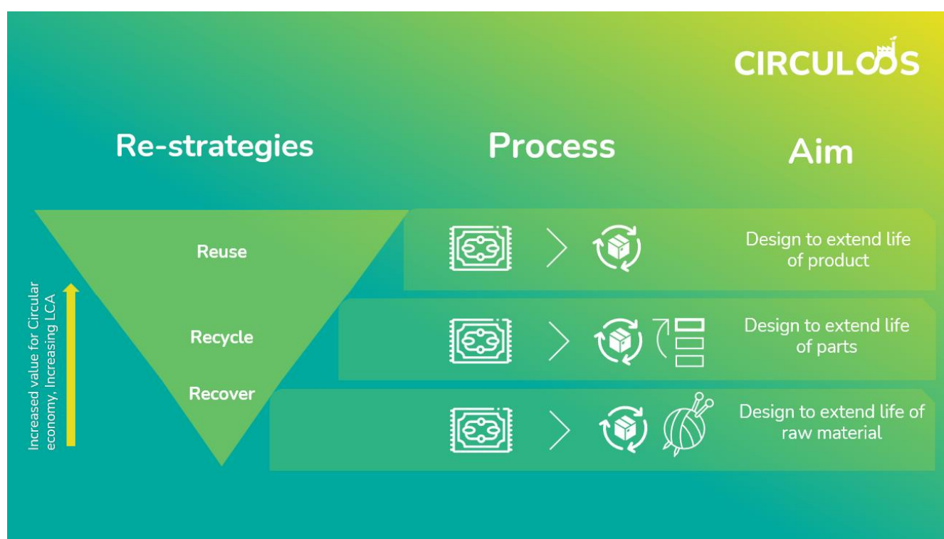
Figure 2 - Circular Pyramid representation

The aim of the Open Calls new pilots, and extensions, is to propose novel value chains and innovative product development that are aligned with waste hierarchy pyramid to reduce waste and its negative environmental impact, particularly on climate change. The waste hierarchy prioritizes waste management options, which from bottom to top move from more linear to more circular practices and thus expected LCA indicators improvements. Also moving in the opposite direction, there is trend to keep the product and extend its life at the end, or moving down to smaller pieces of products till the recovery of its raw materials. By promoting a circular model, where products are increasingly reused or repurposed, the need for new production is reduced, cutting down on resource consumption.