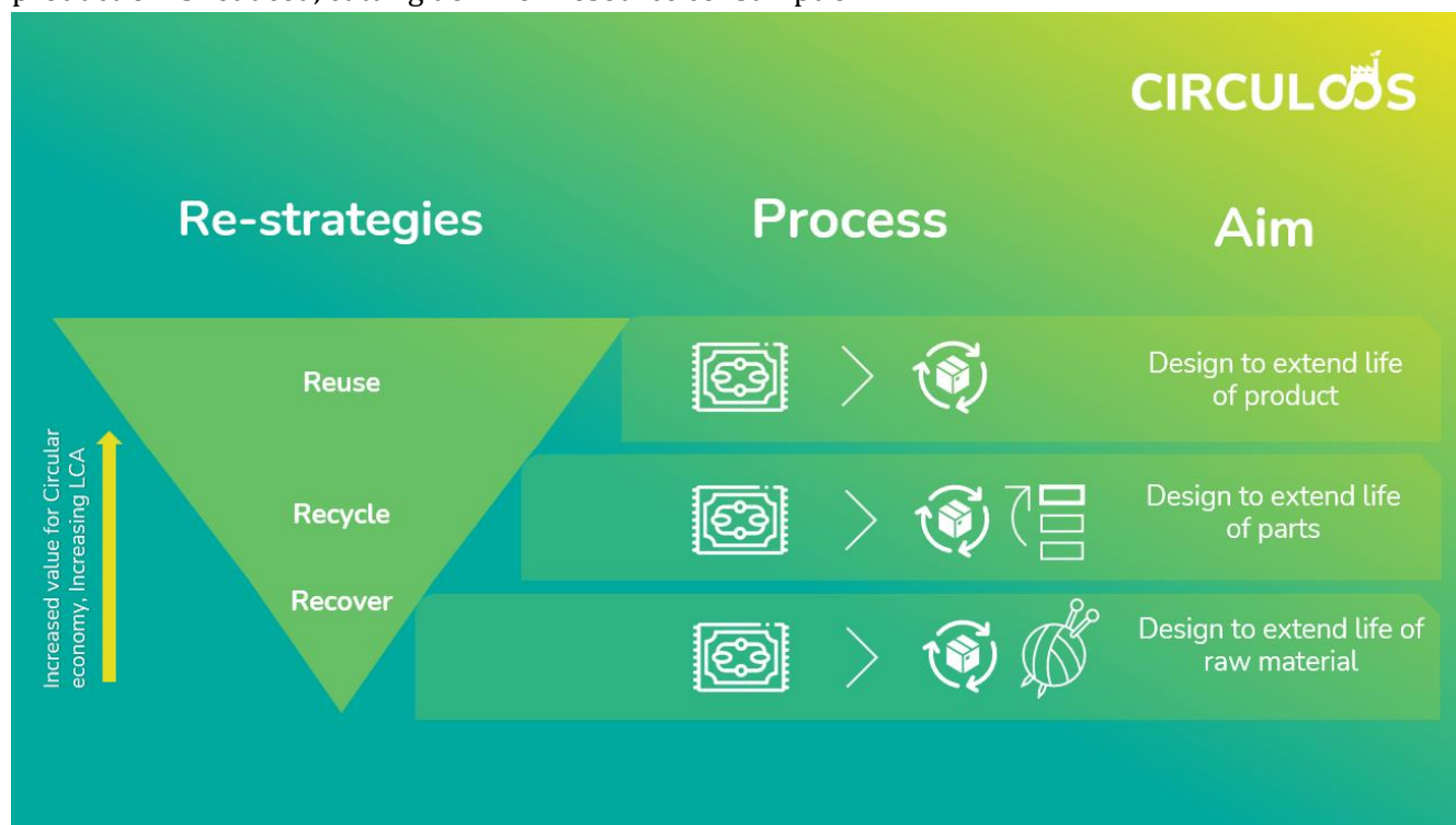
Figure 2 - Circular Pyramid representation

The aim of the Open Calls new pilots, and extensions, is to propose novel value chains and innovative product development that are aligned with waste hierarchy pyramid to reduce waste and its negative environmental impact, particularly on climate change. The waste hierarchy prioritizes waste management options, which from bottom to top move from more linear to more circular practices and thus expected LCA indicators improvements. Also moving in the opposite direction, there is trend to keep the product and extend its life at the end, or moving down to smaller pieces of products till the recovery of its raw materials. By promoting a circular model, where products are increasingly reused or repurposed, the need for new production is reduced, cutting down on resource consumption.