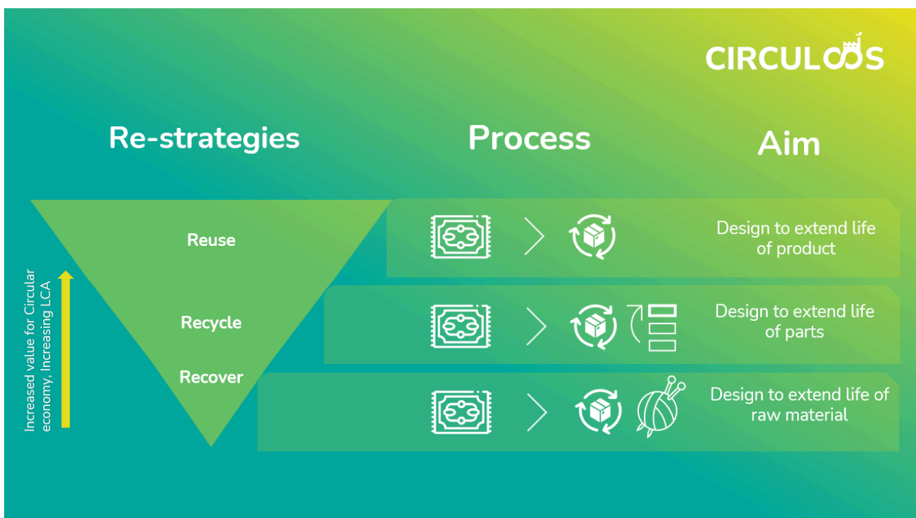
Figure 2 - Circular Pyramid representation

The aim is to propose novel value chains and innovative product development that are aligned with waste hierarchy pyramid to reduce waste and its negative environmental impact, particularly on climate change. The waste hierarchy prioritizes waste management options, which from bottom to top move from more linear to more circular practices and thus expected LCA indicators improvements. Also moving in the opposite direction, there is trend to keep the product and extend its life at the end, or moving down to smaller pieces of products till the recovery of its raw materials. By promoting a circular model, where products are increasingly reused or repurposed, the need for new production is reduced, cutting down on resource consumption.